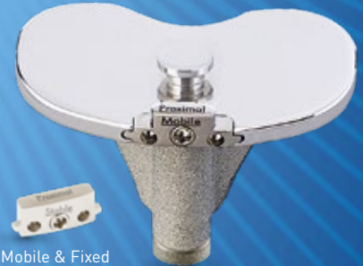
Mobile & Fixed

Length : 54mm* - 56mm* 60mm - 64mm 66mm* 68mm - 70mm* - 72mm 76mm - 80mm