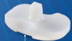
Mobile Bearing Fixed Bearing

6 Different Thickness Size: 8mm - 10mm - 12mm 14mm - 16mm - 18mm