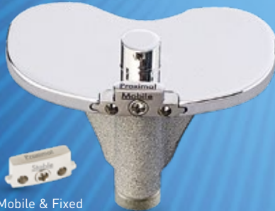
Mobile & Fixed

Length : 54mm* - 56mm* 60mm - 64mm 66mm* 68mm - 70mm* - 72mm 76mm - 80mm