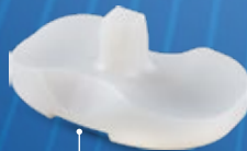
Mobile Bearing Fixed Bearing

6 Different Thickness Size: 8mm - 10mm - 12mm 14mm - 16mm - 18mm