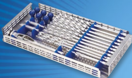
INSTRUMENT SET TRAY - 3 80103011003