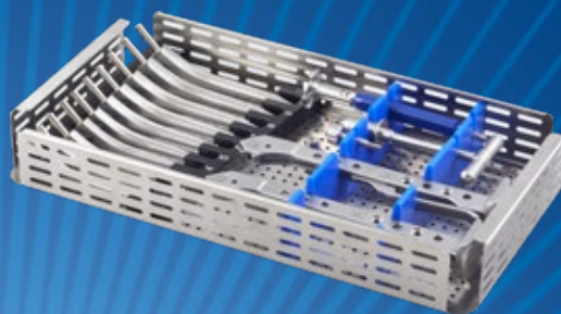
INSTRUMENT SET TRAY - 2 80103011002